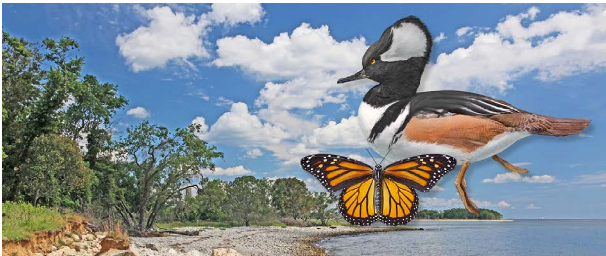
A Field Guide to Long Island Sound

Please use the form on the following page to register.